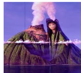
"uku and "lele"